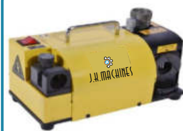
DRILL BIT GRINDER (Pg. No. 18)